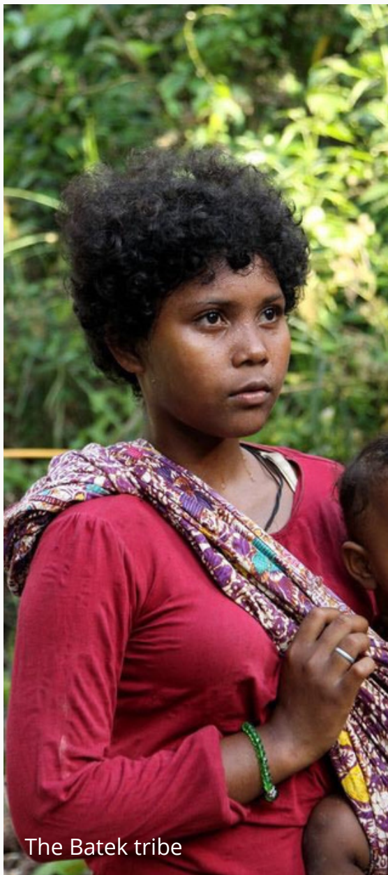
The Batek tribe