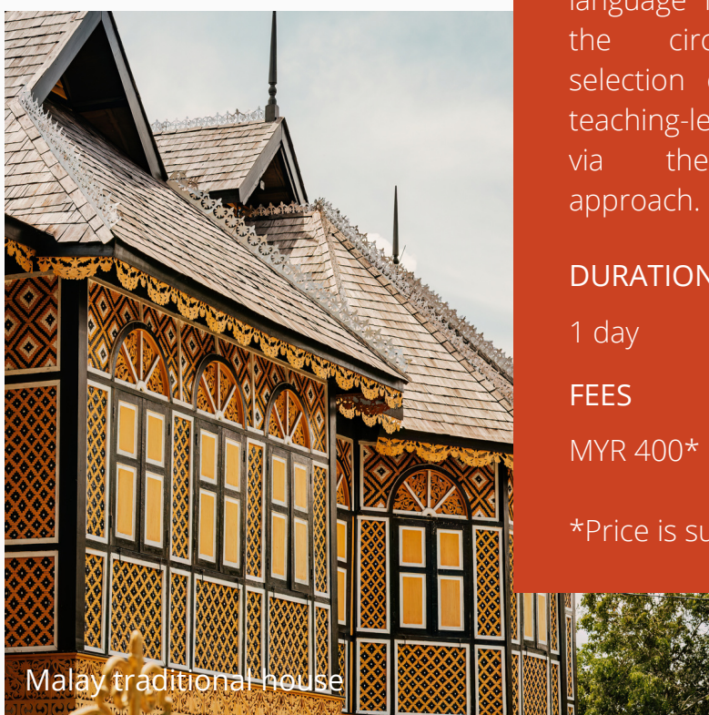
Malay traditional house