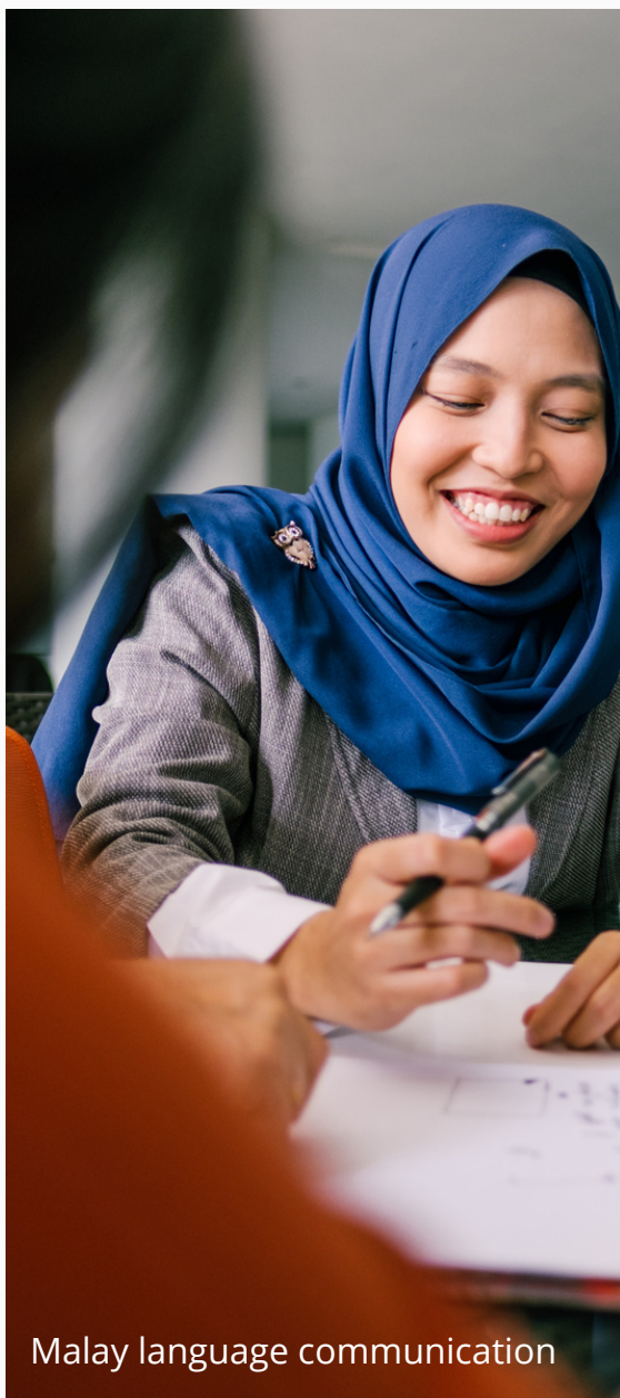
Malay language communication