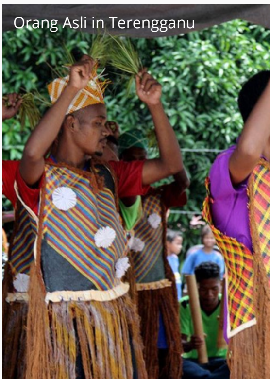
Orang Asli in Terengganu